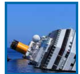
The Art of Cutting Corners P5