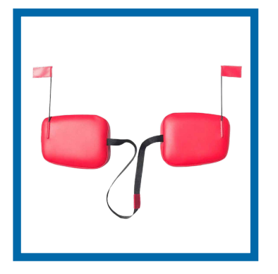
The Society of Flying Cowl Plugs P7