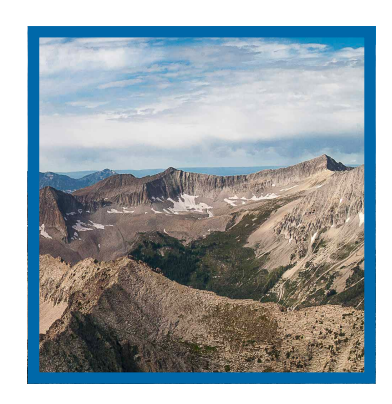
Colorado Mountain Flying Part II P4