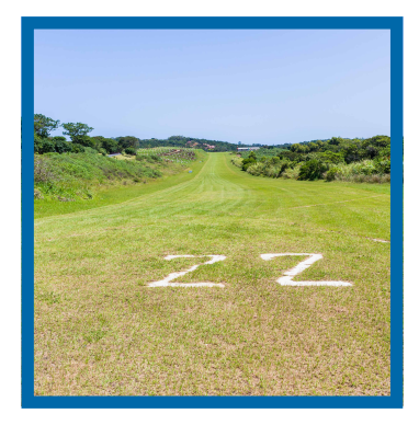
Discovering New Flying Adventures on Grass Runways P2