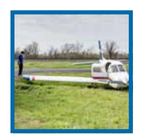
Top 10 Aviation Insurance Myths P1